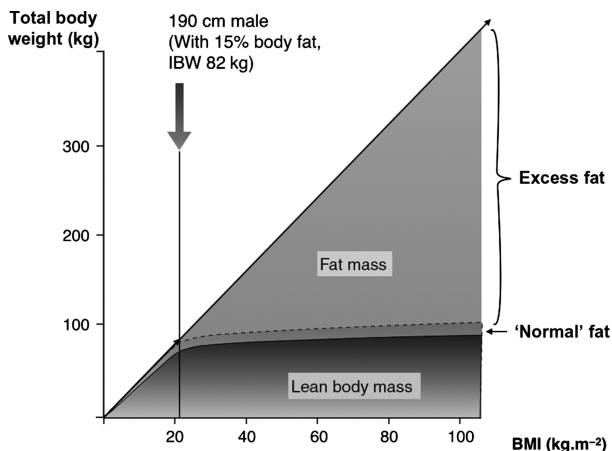
Figure 2 Relationship between total body weight and body mass index (BMI), showing how lean body mass effectively plateaus despite increasing BMI. A male of height 190 cm and ideal body weight (IBW) is indicated, demonstrating how IBW includes a normal 15% fat mass.

anaesthesia, is that lean or adjusted body weight are used as the scalars for calculating initial anaesthetic drug doses rather than total body weight (Table 3).